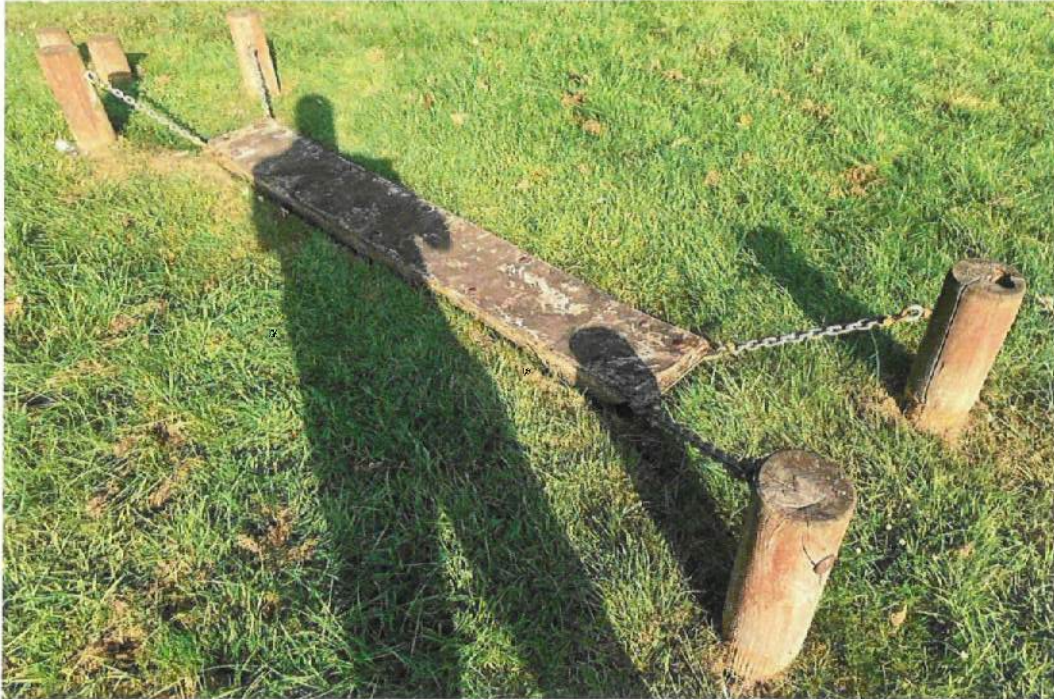
Timber bridge support leg has failed requires replacing