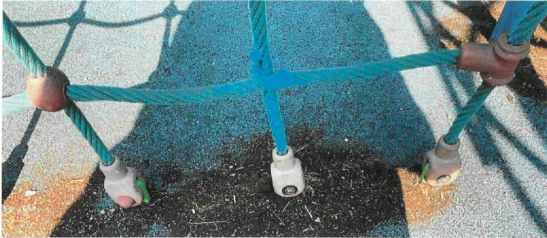
Sections of the rope cargo net showing exposed inner wires