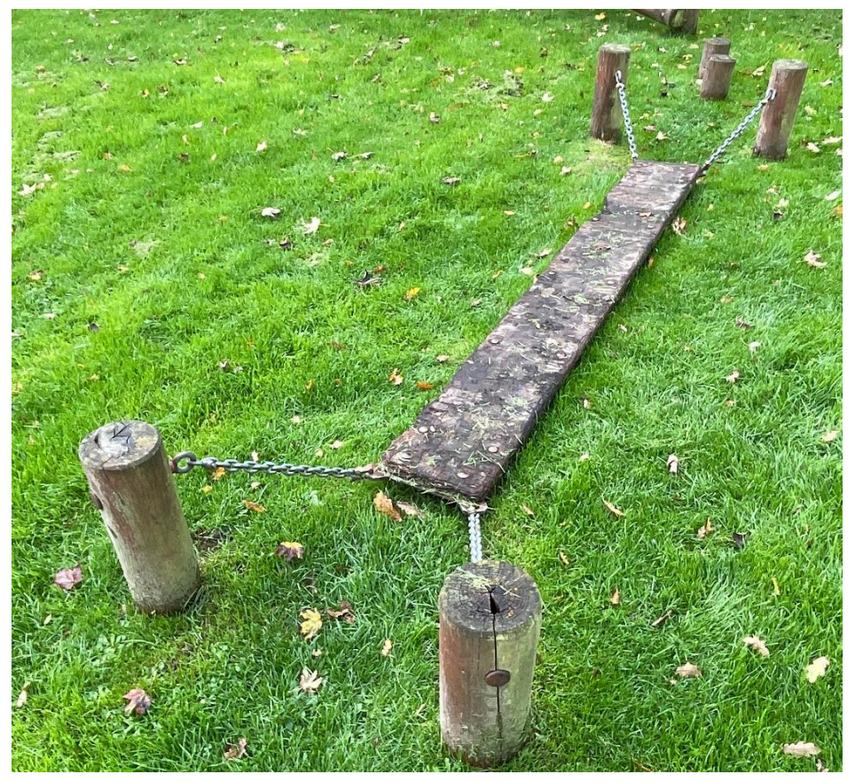
Stepping log has rotted away leaving thin stump if fallen on could cause injury