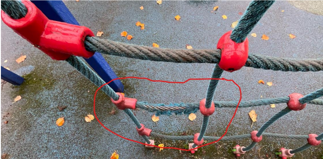
Two sections of the rope cargo net showing exposed inner wires