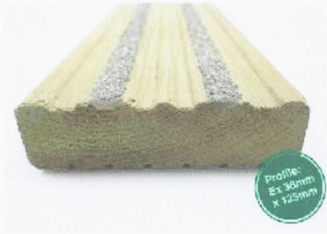
ANTI SLIP DECKING BOARDS