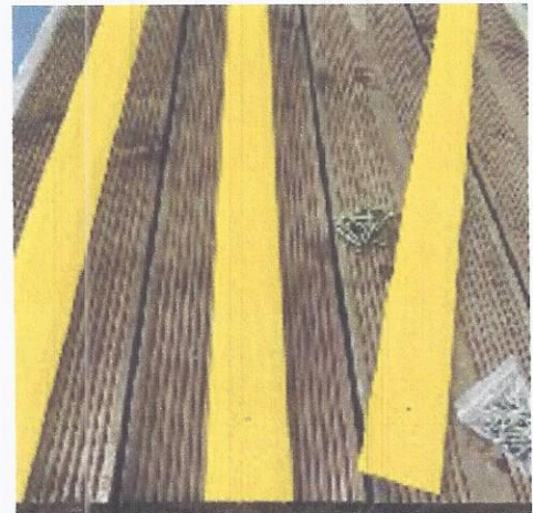
DECKING WITH COLOURED ANTI SLIP STRIPS