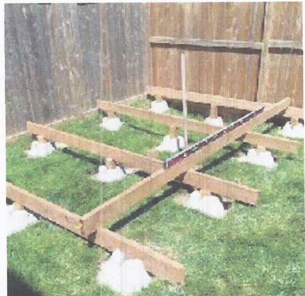
CONCRETE DECK BLOCKS FOR A FLOATING DECK