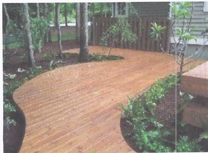
LOW LEVEL LAID DECK, SHAPED CUT