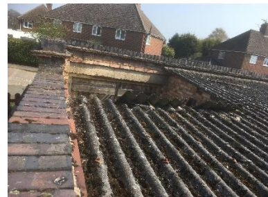
Hole in asbestos roof