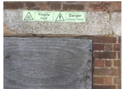
Fragile roof warnings