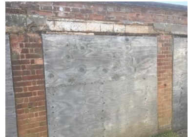
General state of disrepair